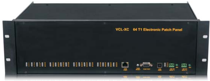
XC 64 T1 Electronic Patch Panel

The XC 64 T1 electronic patch panel allows the user to cross-connect any T1 port to any T1 port, electronically through user executable software commands, without having to use any patch-cords or loosely hanging inter-connect cables.