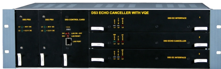
DS3 VQE and Echo Canceller

Orion offers the industry's most compact DS3 Voice Quality Enhancement (VQE) echo canceller solution in a 19-inch, 3U (44mm height) chassis, with echo tail-displacement (echo tail off-set) feature which is user programmable from 0 ms. to 512 ms. Echo cancellation on each channel is 128 ms. bidirectional (near-end and far-end). The DS3 VQE and echo canceller solution offers a unique, user definable echo-tail displacement feature which may be programmed by the user, between 0 ms. to 512 ms. on the return path to cancel echo-tails, both at the near-end and the far-end, even in the most demanding network conditions.