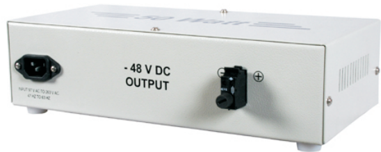
VCL-AC to DC Converter

This is an external converter power supply, which is available in a portable desktop version with one fused - 48 V DC output.