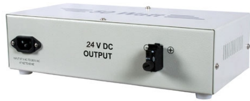
VCL-AC to DC Converter

Orion's AC to DC converter may be used to convert 85V AC-264V AC, 47Hz-63Hz AC Mains Input Voltage to 24 V DC output voltage. It may be also used to convert 120 V DC - 370 V DC Input Voltage to 24 V DC Output Voltage.