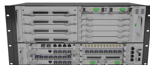
VCL-1400 - 7 Slot with expansion chassis