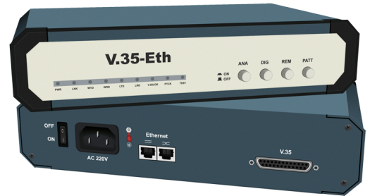
Front and Rear View

The equipment shall be used and installed always in pair and work only in pair, one device at either end.