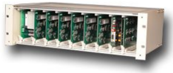
VCL-DX, E1, Drop-Insert, Digital Data Multiplexer

An extensive set of alarms, for easy maintenance are provided in the system.