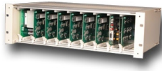
VCL-DX, E1, Drop-Insert, Digital Data Multiplexer

An extensive set of alarms, for easy maintenance are provided in the system.