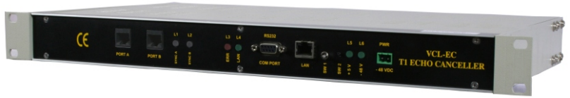
T1 Echo Canceller 1U (44 mm high) 19 inch Version with Telnet

Orion offers a compact, robust and cost effective T1 Echo Canceller solution in 19 inch, 1U high (44mm height) chassis (accommodates 1, T1 Echo Canceller with telnet, per shelf). Echo cancellation on each channel is 64ms. bidirectional/128ms. unidirectional echo tails - user selectable. T1 Echo Canceller is also offered and available.